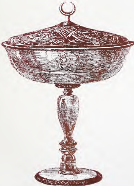
CUP BELONGING TO THE DUCHESSE D'ETAMPES.